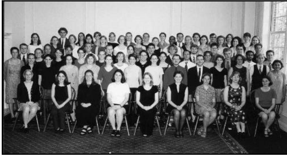
On April 22nd, 2001, over 80 Truman students became the first members in course to be initiated into the Delta Chapter of Missouri