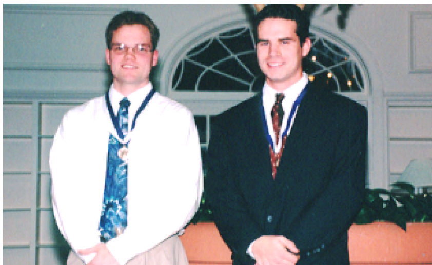
General Honors December 1999 Graduates